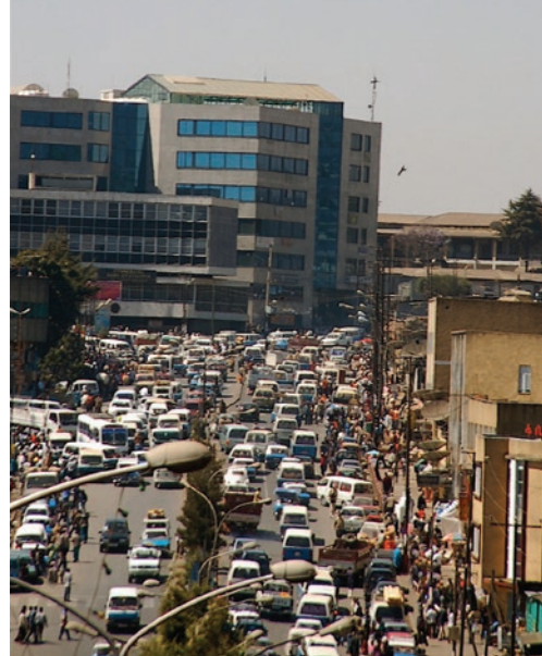
Addis Ababa, Ethiopia's bustling capital city.