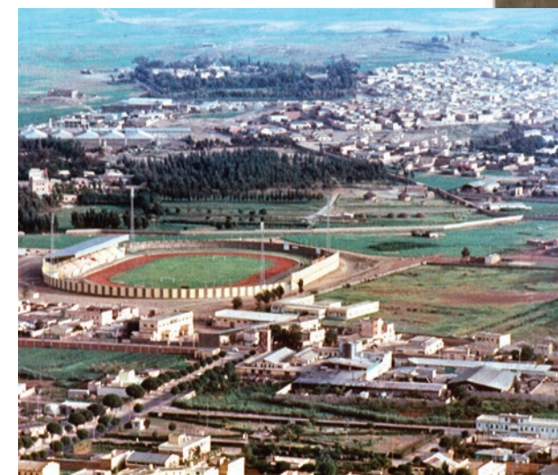
Aerial view of Asmara from 1981.